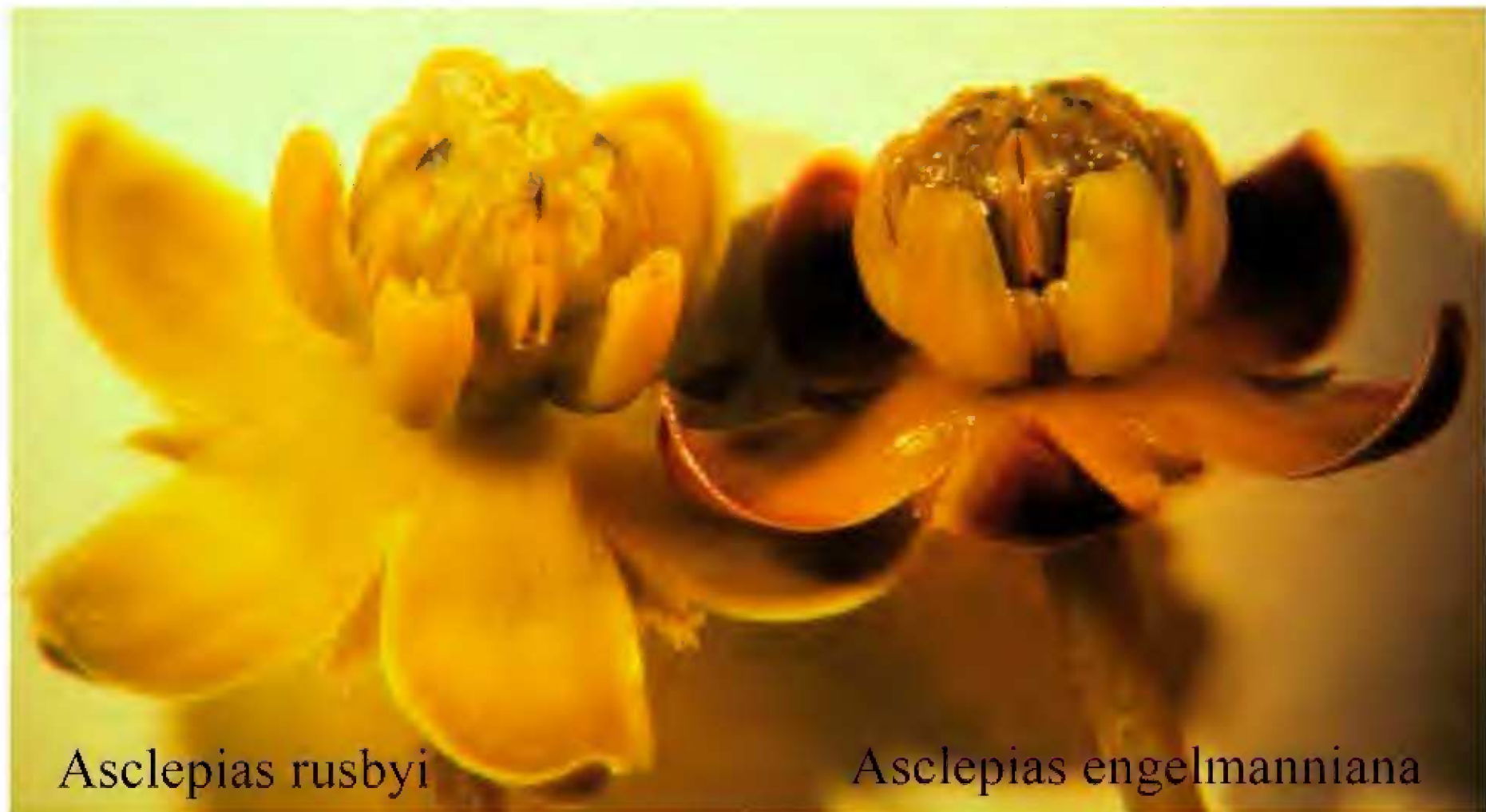
Figure 1. Two flowers compared: Asclepias rusbyi and Asclepias engelmanniana .